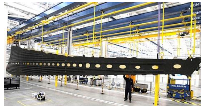
Integrated demonstration with manufacturing database and decision support tools