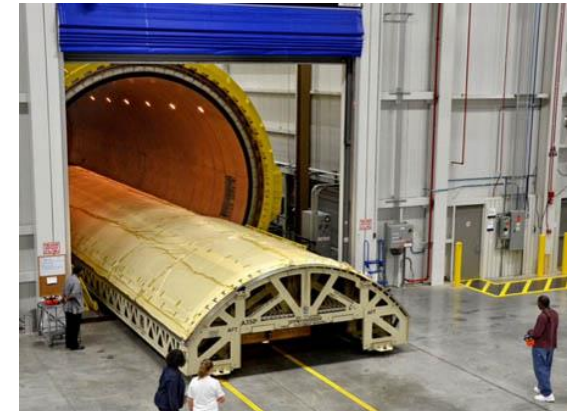
Sensor for curing monitoring