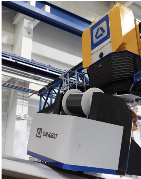
Inline Quality control for ADMP