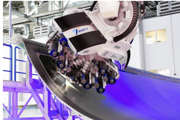
Inline Quality control for AFP